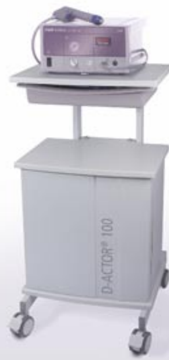
Closed-type trolley for oil compressor Article number <15149> Height: 94 cm