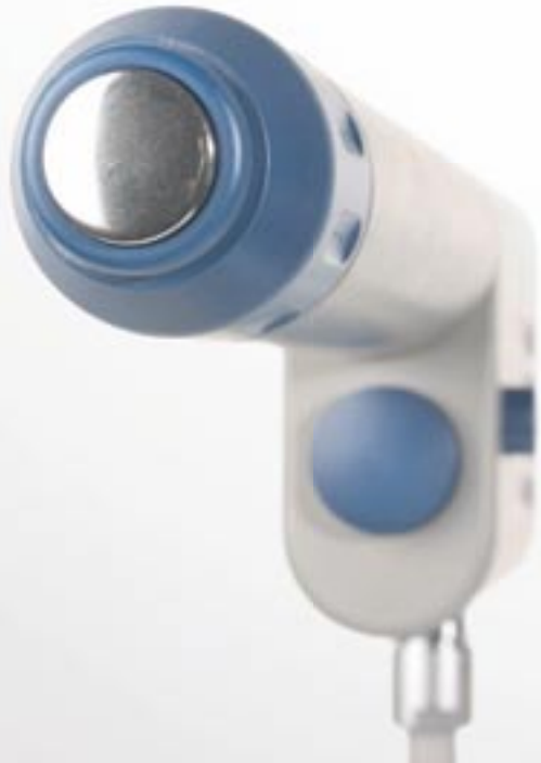
15 mm: classic activator with hygiene cap