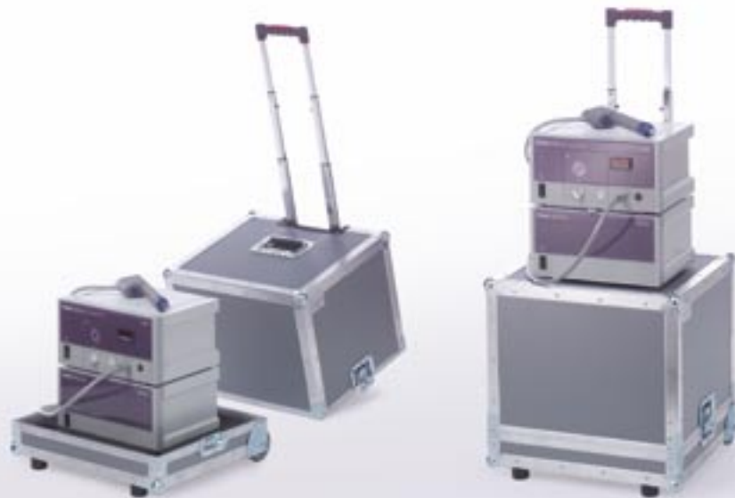
Transport suitcase Article number <13472> Dimensions (w x h x d): 50 x 60 x 50 cm